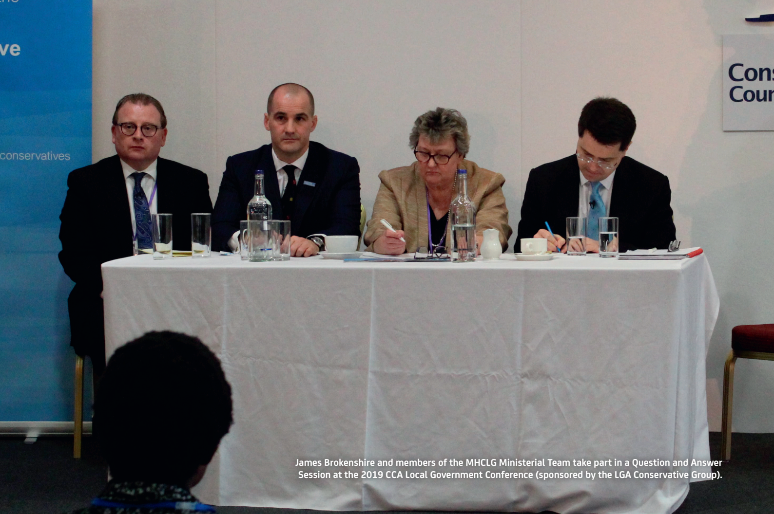
James Brokenshire and members of the MHCLG Ministerial Team take part in a Question and Answer Session at the 2019 CCA Local Government Conference (sponsored by the LGA Conservative Group).