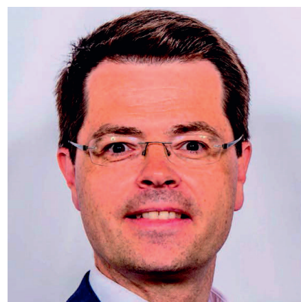
The Rt Hon James Brokenshire MP

You are among our most committed and important public servants and it's a privilege to be representing and working alongside you to make a difference and help people build better lives.