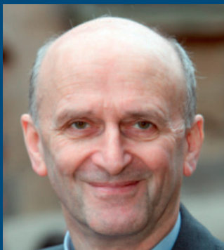
Cllr Philip Atkins OBE Staffordshire County Council