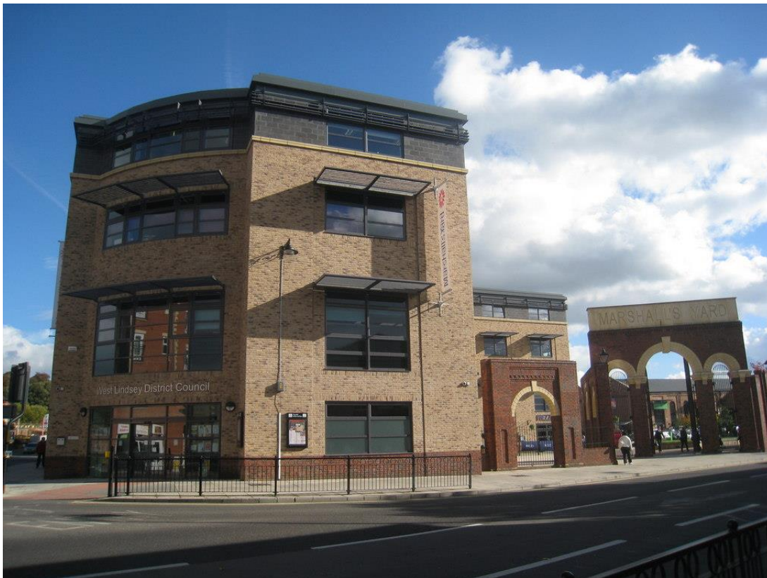
West Lindsey Council Offices.

This new way of working is supported by fortnightly workshops to allow all planning officers to talk about their applications as a wider team. The workshops allow the team to discuss complex projects as a group and junior staff are encouraged to speak up. Confidence across the team has grown and this approach has enabled this change.