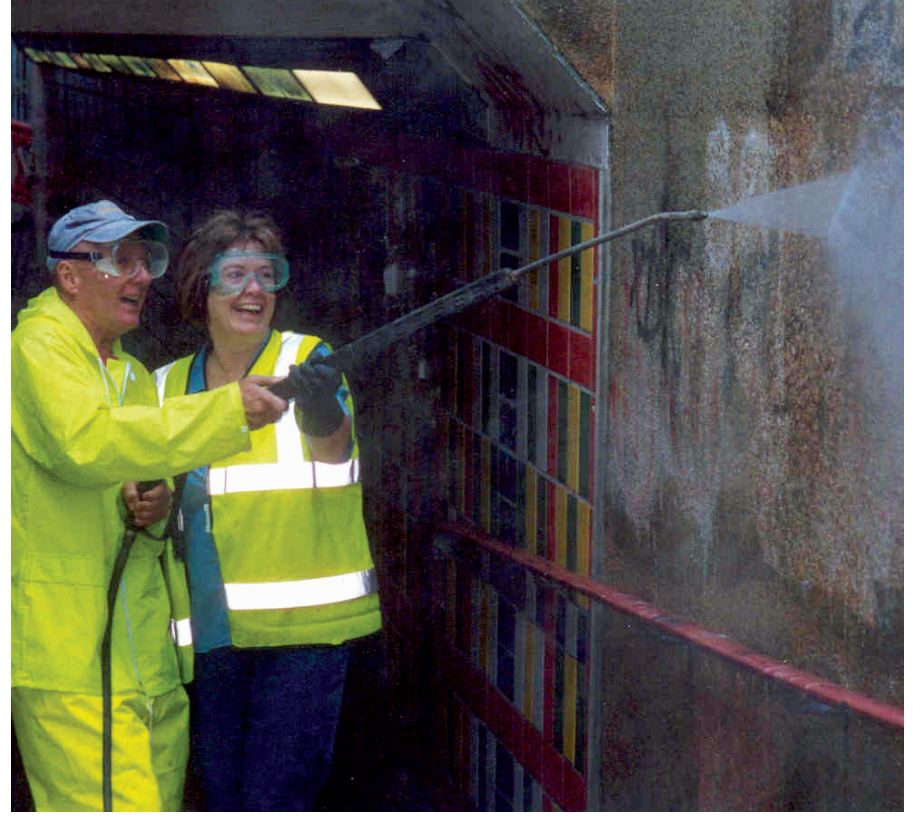
An early achievement was to improve the council's streetcare services with measures such as quicker graffiti removal.

Three Rivers, St Albans and Hertsmere, we had a strong council presence.