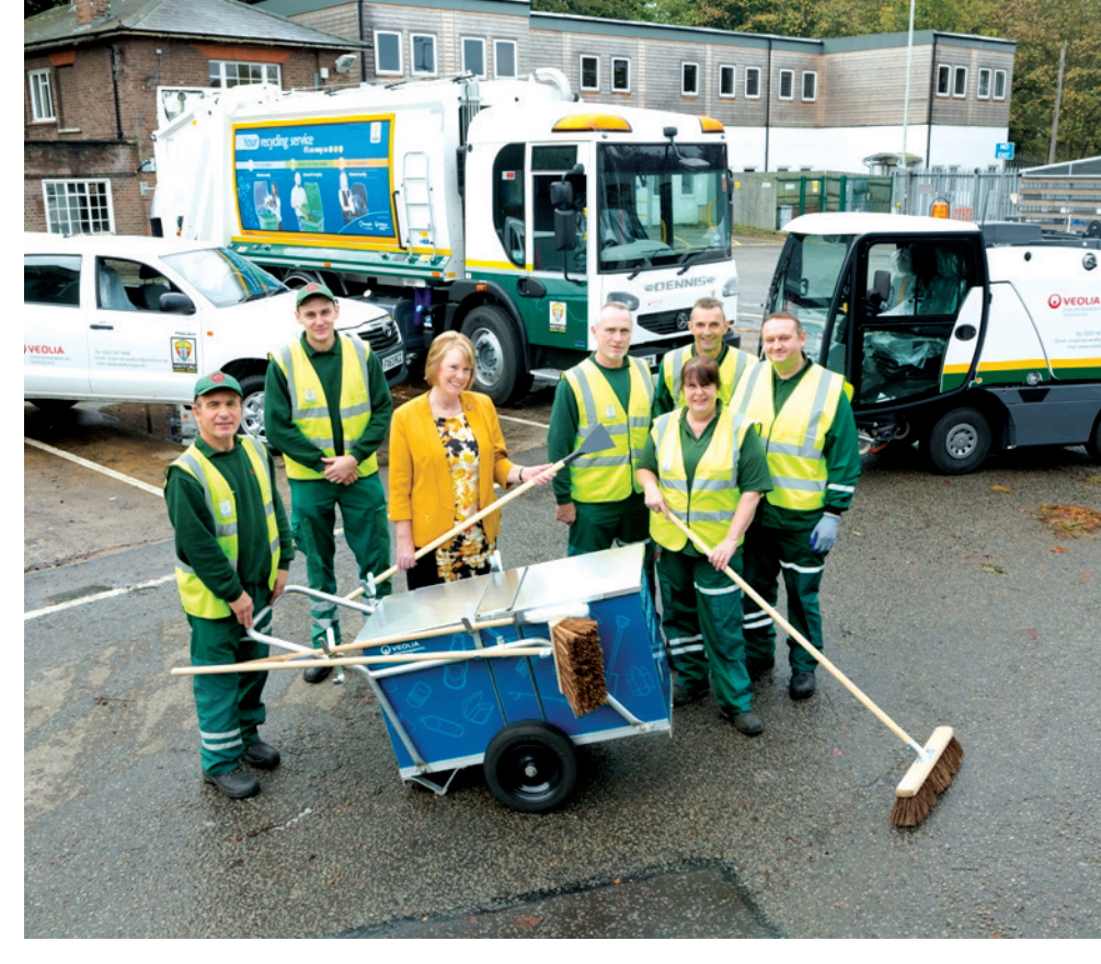
A high standard of basic services such as street cleaning is at the heart of Watford's Lib Dem regime.

sounded worthy enough, even though they were often ineffective or poorly managed. Such things were hard to oppose without making us sound like the Conservatives. We lacked confidence in the council chamber. Labour had a few confident and even bombastic speakers and we had no obvious bruisers in our team to match them