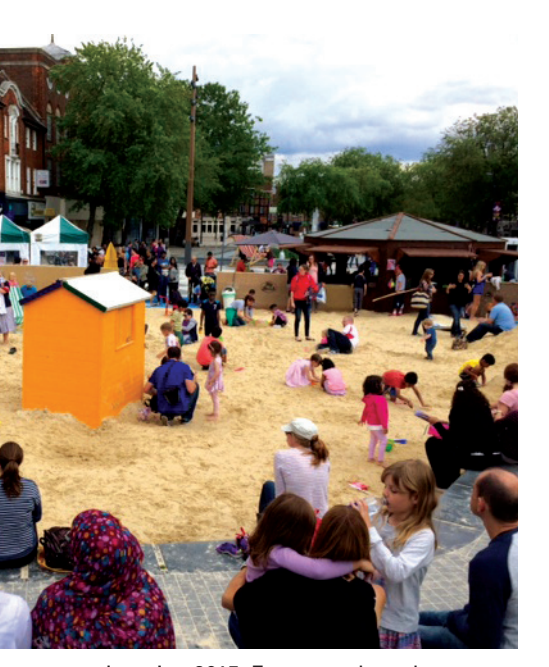
Imagine 2015: Events such as the Big Beach and the Imagine Watford festival have linked leisure and culture to regenerate the town centre.