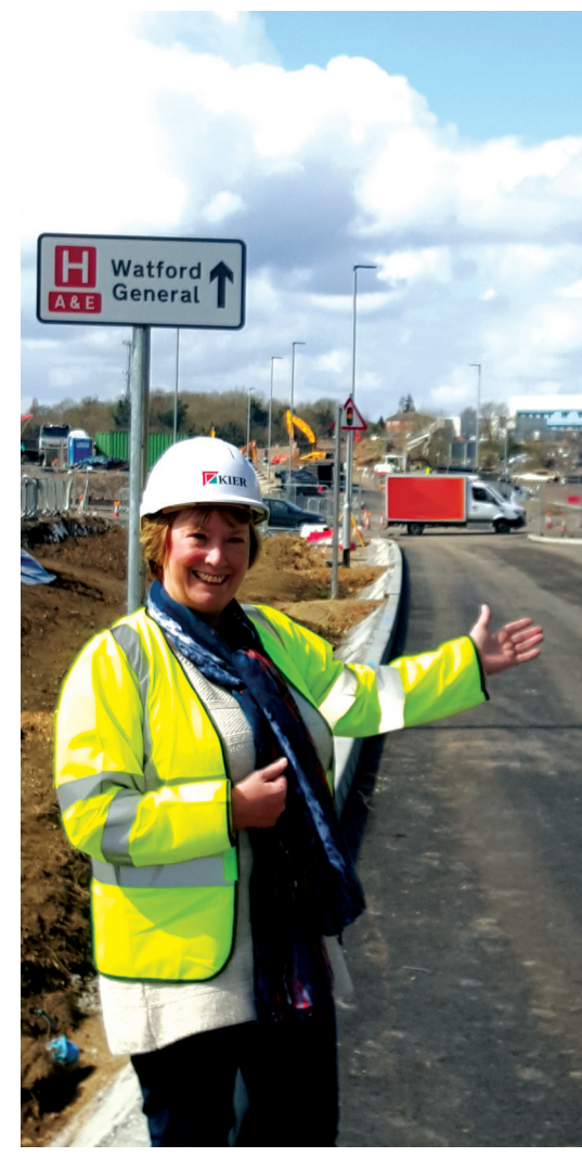
Providing a new access road helped to save acute hospital services in Watford.

Other projects included a major town centre improvements scheme to create a big outdoor events space. This was in a part of the town known for its nightlife. It had developed a reputation (not always deserved) for late-night rowdiness. Part of our vision was to create a family-friendly town centre - not just a place for shopping and nightclubbing but somewhere that offered other reasons to visit. The new events space has hosted an outdoor theatre festival, an urban beach and outdoor film screenings in the summer, and an ice rink in the winter as well as sports days and literary and art festivals. The demographic profile of