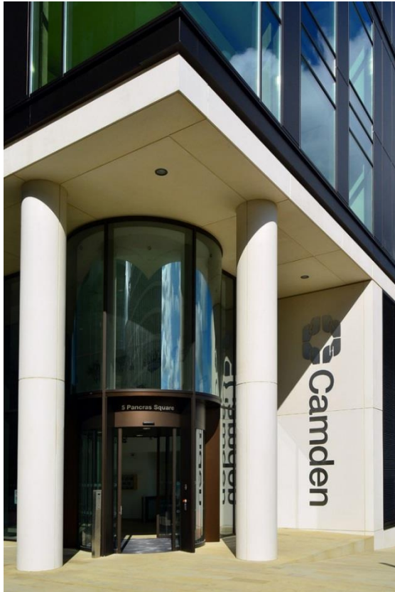
Camden Council Offices.

their reports concise. Some committee reports can still be quite lengthy, but this reflects the scheme of delegation which means that only complex and contentious major applications go to committee. Thus, longer reports are limited in number.