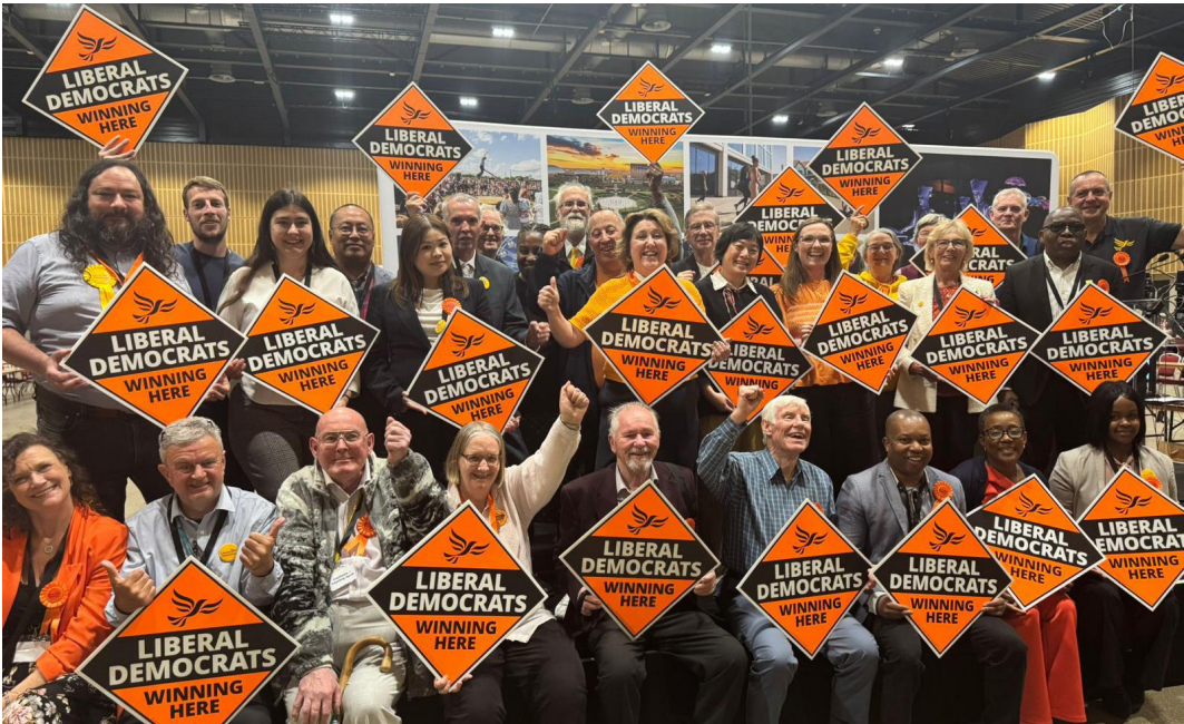
Liberal Democrats celebrate becoming the largest party on Milton Keynes Council

I look forward to fighting for Liberal Democrat values within the LGA at a time of rapid change both at the LGA and in the wider political environment.