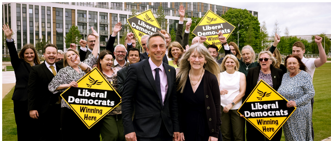
Liberal Democrats retained the leadership of Hull City Council