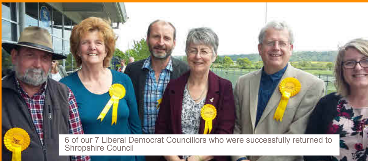
6 of our 7 Liberal Democrat Councillors who were successfully returned to Shropshire Council