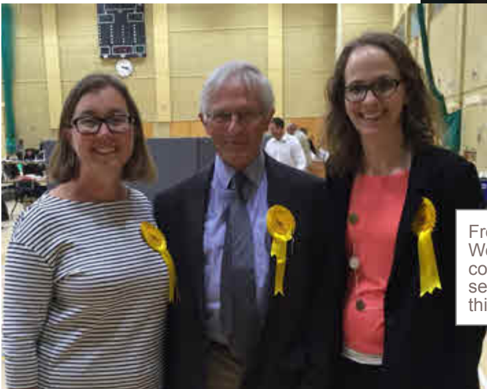
From County Durham (above) to West Sussex (left) and across the country, Liberal Democrats gained seats from both Labour and Tories this May