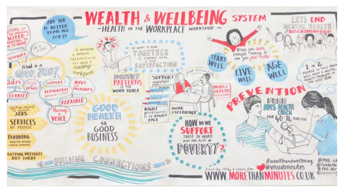
Wealth and wellbeing workshop: Visual minutes