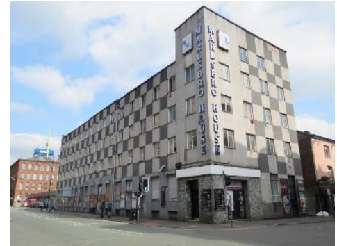
Marlsbro House Manchester