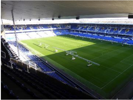
Goodison Park, Liverpool (Everton FC)