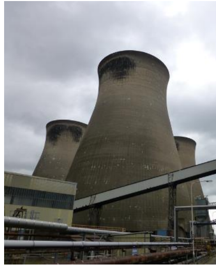
Ferrybridge C Power Station Knottingley