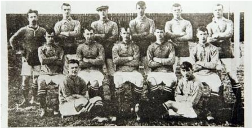
"Cardiff City's First Professional Players."