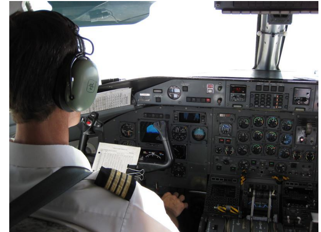
"checklist for cruise altitude." by bboykanky is licensed under CC BY-ND 2.0