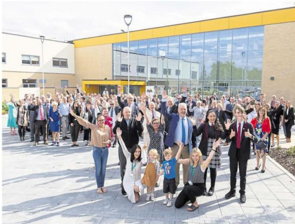
Members of the community and organisation representatives at the opening.

“I am absolutely delighted to see people who have been using the new facilities already on a regular basis officially opening the building, including some who were not even